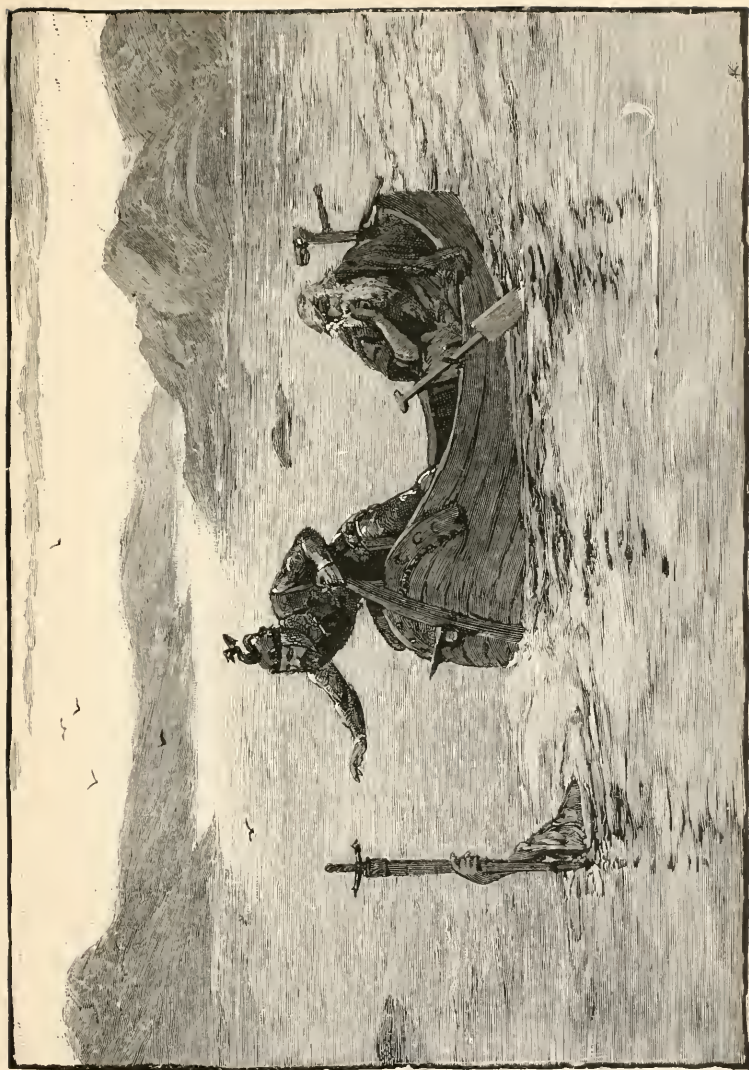
How Arthur got his Sword Excalibur.